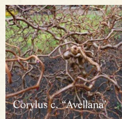
Corylus c. "Avellana"

such as Cornus alba 'Elegantissima' "Red Twig Dogwood" or Cornus 'Midwinter Fire' are beautiful in winter as long as they are pruned to the ground early each spring. This ensures fresh growth each year which is the most colorful. Viburnum bodnatense 'Pink Dawn' starts to flower just as the calendar ticks over the New year. The clear pink flowers would seem more appropriate in May but are welcome in January to give us that brief glimpse into what is ahead. No article on winter plants would be complete without speaking of Hamamelis "Witch Hazel". These workhorses of the garden have bloom times that range from the