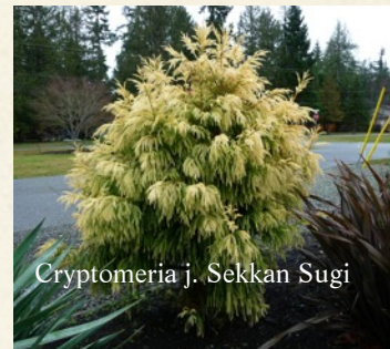
Cryptomeria j. Sekkan Sugi

most stunning is Cryptomeria japonica 'Elegans'. This very soft looking pyramid shaped tree is a mid green in summer but turns a magnificent bronze in winter. This lovely tree can grow to 25 feet or more over 30 years but most top out at about 15 feet over that time. Another smaller Cryptomeria with lovely winter bronzing is Cryptomeria japonica 'Vilmoriana'. This dwarf conifer tops out at about 1 meter high and wide. Cryptomeria japonica Sekkan-Sugi is a real show stopper with yellow foliage that turns almost white in winter. Deciduous trees and shrubs also have many great winter interest varieties.